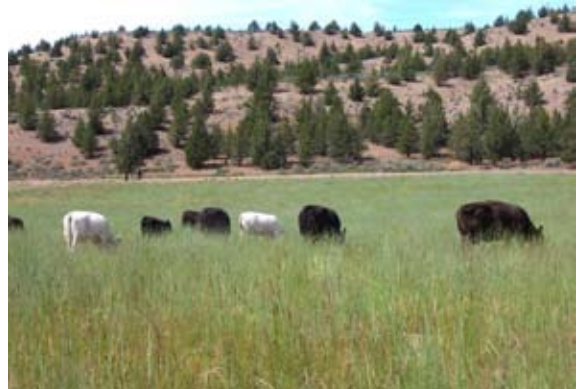
Sunny Ridge Murray Greys Madras, OR

Ballots can be presented in person by the MEMBER ONLY at the Annual membership meeting.