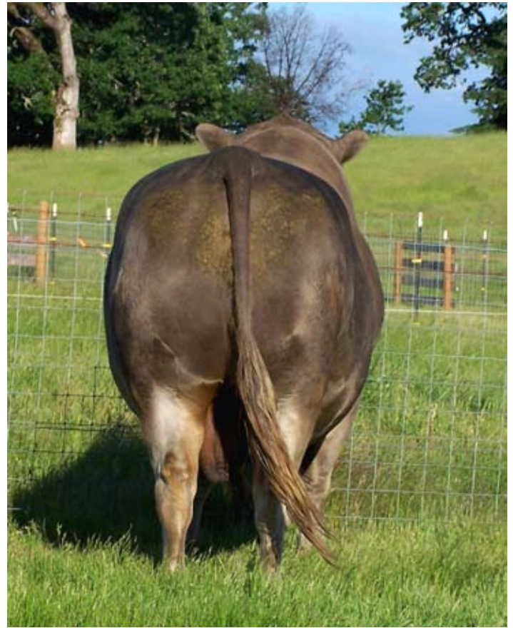
The “business end” of our cover bull JB Roar