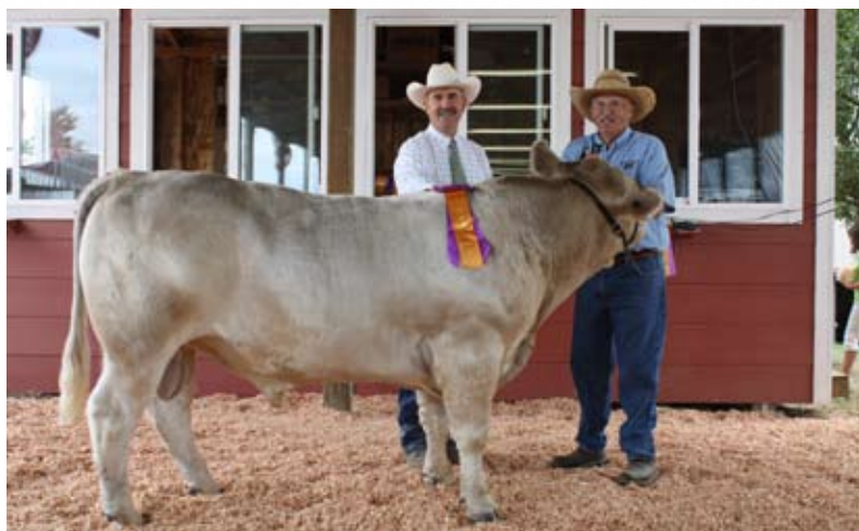
DG Victory Sunset Grand Champion Bull Clark County Fair Diamond G Farm