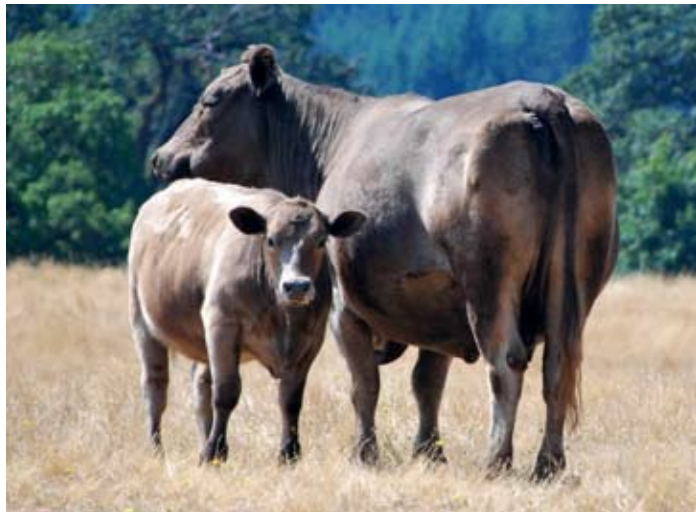
Growing calves is what it's all about! Thanks to Bonnie Sicard and Dusty Craig