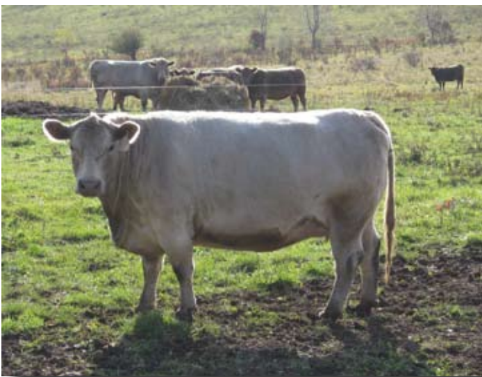
One of the Deco Murray Grey Brood Cows that may be supplying beef to the Ansonia Valley Inn