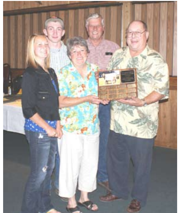
Cow Calf Champion Award Hillside Acres, Sweet Home, OR