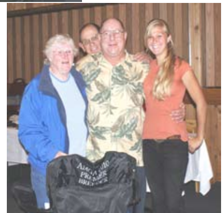
Premier Breeder PattiRex Ranch, Kuna, ID