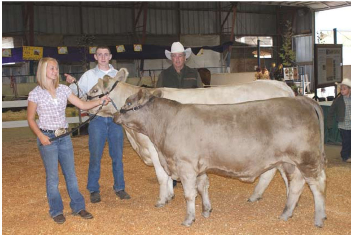
National Supreme Champion Grand Champion Female HA Tomorrow with HA Xpress