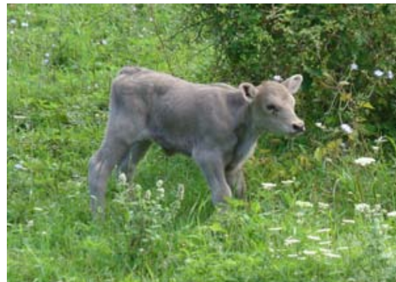
Baby MG calf in New England wild flowers.

The Association hopes that the online data system will be ready for use by, or shortly after the first of the year. BreedPlan members will be notified when the system is available and ready.