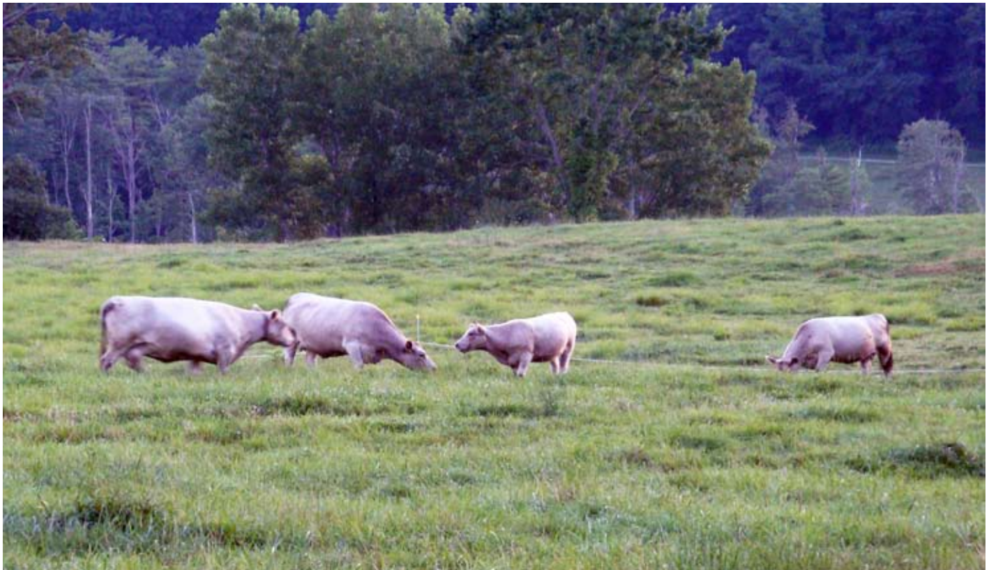
Riga View Murray Greys Salisbury, CT

The "Murray Grey News" is published quarterly; March, June, September and December by the American Murray Grey Association, PO Box 43515, Louisville, KY 40253. All articles and advertisements should be sent to AMGA by the 10th of the month preceding publication. All "Letters to the Editor" must be signed. Disclaimer: Advertisers assume full responsibility for all content of advertisements printed as well as any claims arising therefrom against the publisher. The American Murray Grey Association retains full editorial rights to all material submitted and may refuse to publish any advertisement, article or Letter to the Editor that may be submitted or offered for publication.