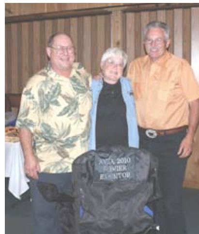
Premier Exhibitor Diamond G Farm Vadar, WA