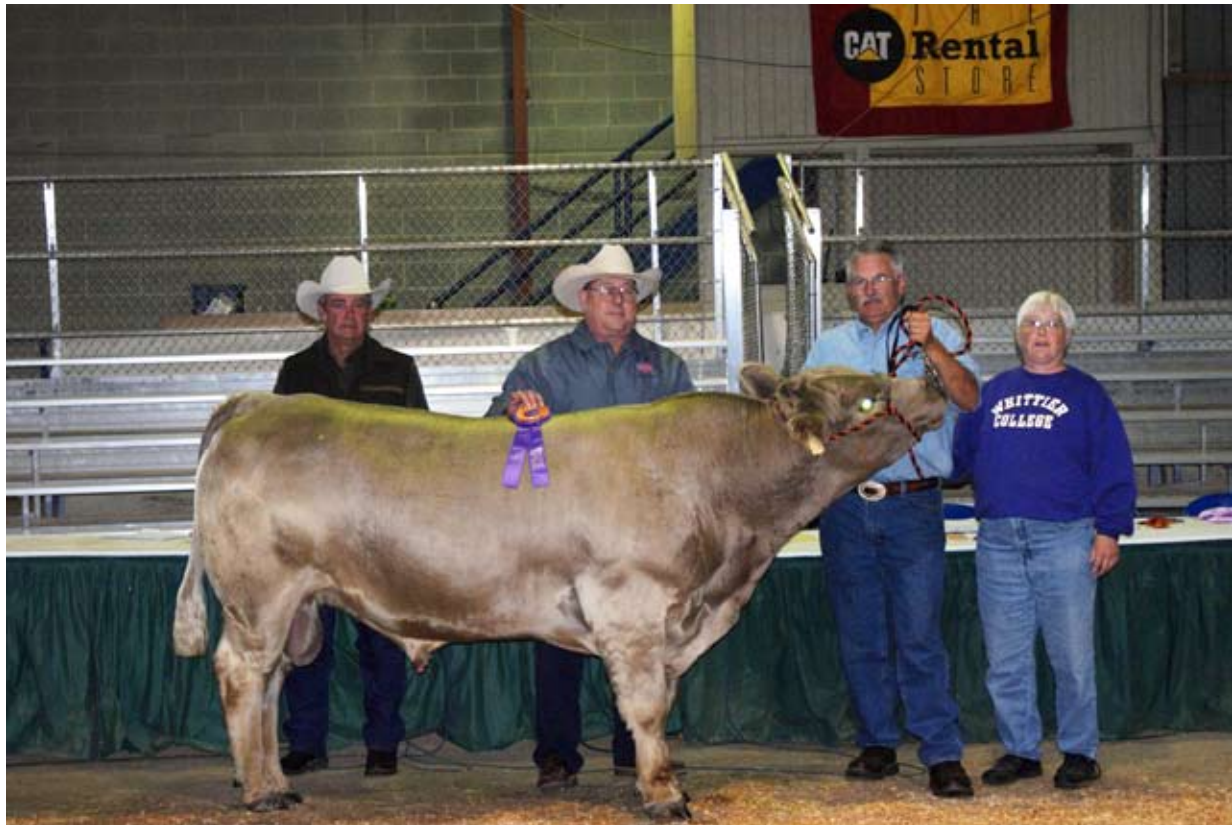
National Grand Champion Bull DG Victory Sunset